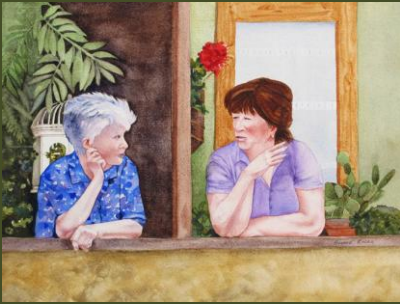
“Conversation on the Balcony”