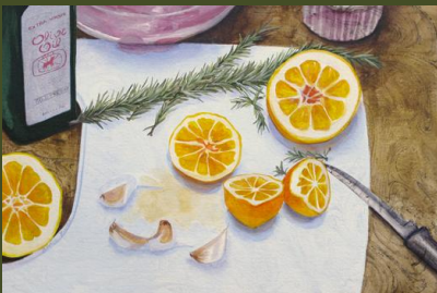
“Lemon Rosemary Marinade”