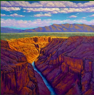
Art titled "River Gorge"