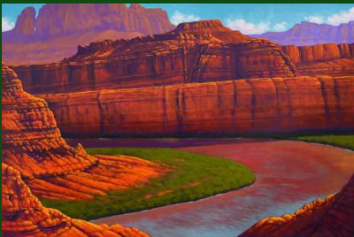
Art titled "Through the Canyons"