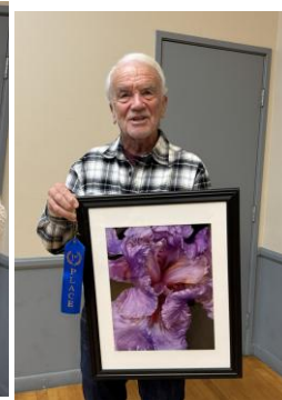
Enhanced photography Steve Chase 1 st .